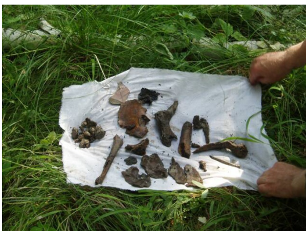
Figure 2 Skeletal remains and archeological artifacts recovered from the 2007 site.

The approach to the DNA testing by Gill et al. [7] was twofold, using autosomal STRs and mtDNA sequencing of the two hypervariable regions (HVI and HVII). STR testing was used as a sorting tool to distinguish each skeleton and show the putative familial relationships among the remains. At the time of the DNA testing, autosomal STR markers were in their infancy. The FSS