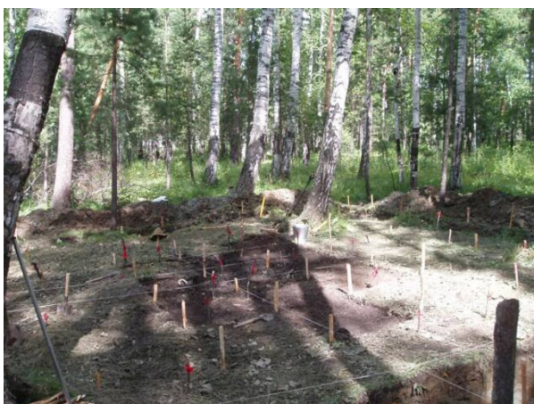
Figure 1 Excavation of the site where three amateur archeologists discovered the remains of the two missing Romanov children in the summer of 2007.