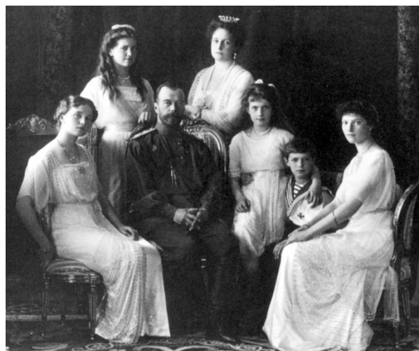
Figure 4 The last Russian imperial family. Left to right: Olga, Maria, Nicholas II, Alexandra Fyodorovna, Anastasia, Alexei and Tatiana.